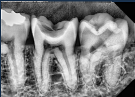
Periapical - Molar region