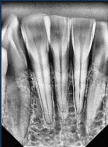
Periapical - Anterior region